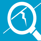
NDT & WELDING